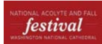
National Acolyte Festival