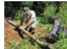
Reaching the Pygmies