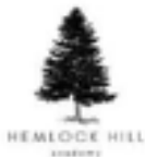
Hemlock Hill Nature