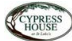
Prison Re-Entry Program