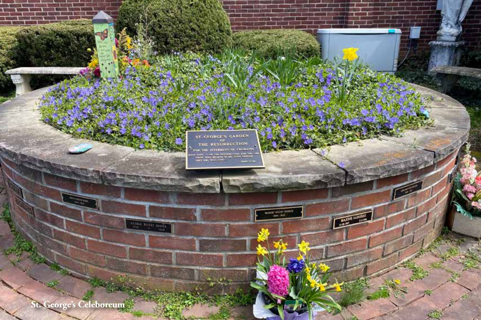
St. George's Celeboreum

St. George's Episcopal Mission began in November, 1908. With a starting boost from personnel from the Diocese of Bethlehem, the members met in a second floor storage area of the borough high school.