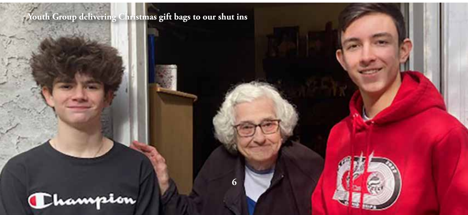
Youth Group delivering Christmas gift bags to our shut ins

Yearly we participate in the UTO by offering thanks and prayers by dropping a coin in the UTO box or envelop.